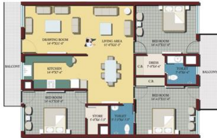
Image is an artistic rendering only and actual product may/will vary.