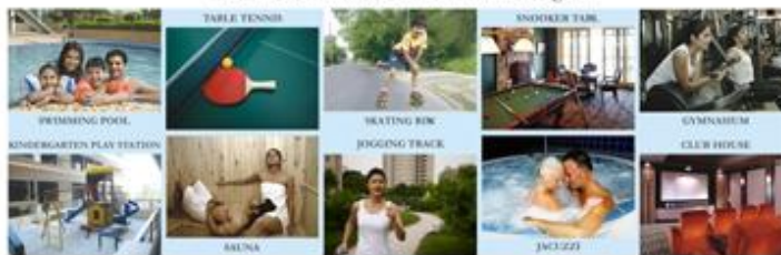
View of the facilities available at Palm Heights