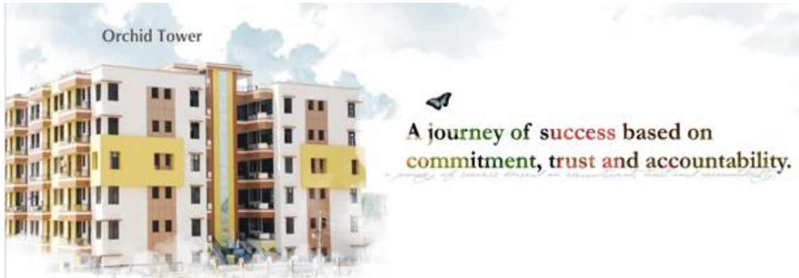
Actual Photos of already completed project.