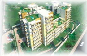
Actual Photo of already completed project.